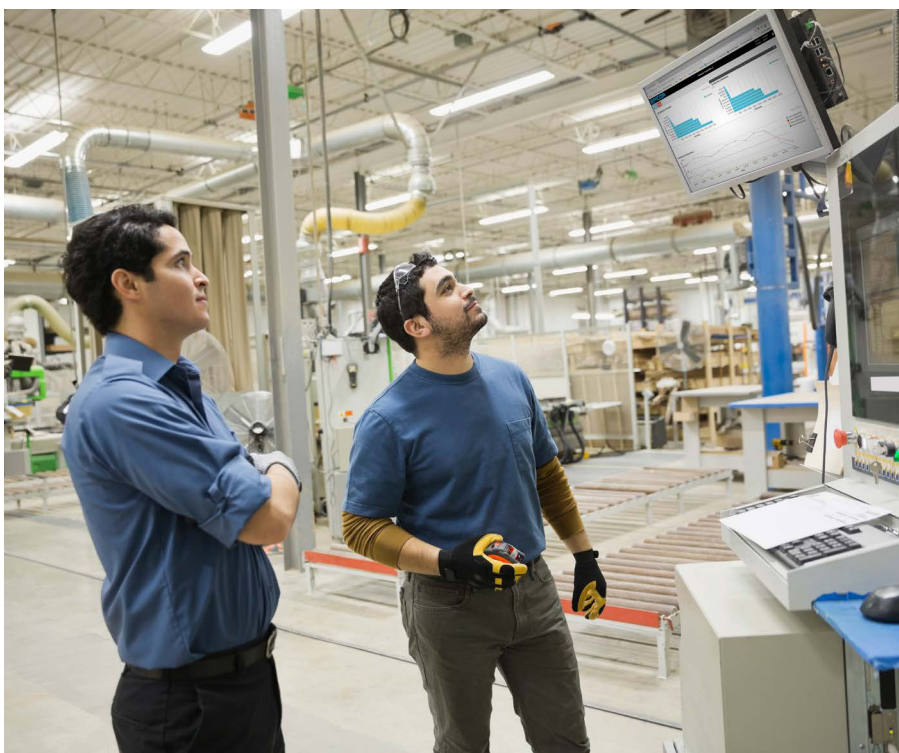
Public Internal Dashboards production floor use example