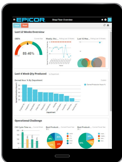
Dashboard on a tablet